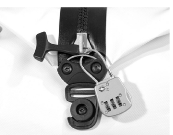
Wire loop for locking the bag with padlock (padlock not included)

Bergsteiger TIPP Proofness, mountaineering magazine Bergsteiger, February 2011